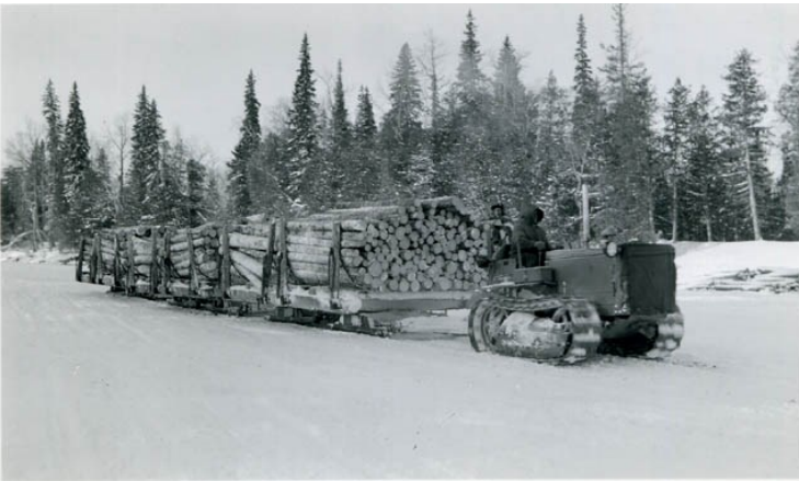
Figure 3: Tractor train used at Spruce Falls Power and Paper bush camps in the 1930s.

The mill owned its own railway known as the Smoky Line. It ran for about 50 miles north to a generating station at Smoky Falls. In addition to serving the Smoky Falls generating station and three other hydro-electric stations, the railway hauled pulpwood to Kapuskasing and served the Smoky Falls residents which had no road access until 1974. In 1946, a 10.5-mile spur line was built to Neshin Lake to pick up wood from the Opatatika River watershed.