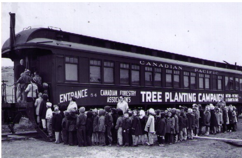
CFA Tree Planting Campaign Rail Car

The Prime Minister had said "we must consider, and before it is too late, address questions of the highest importance to the future wellbeing of this Dominion and its forests and water resources." Throughout the decades to follow, conservation messaging waxed and waned with the two world wars creating gaps. Fast forward to the 1950s, when the association was prolific in its influence. The affiliated provincial forestry associations such as the CFA of British Columbia, the CFA of New Brunswick and Nova Scotia, and the Prairie Provinces Forest Association were soon to become autonomous, the Ontario Forestry Association had become its own entity in 1954. Soon each province had its own association, and the CFA took on the legal status as a Federation of Provincial Forestry Associations.