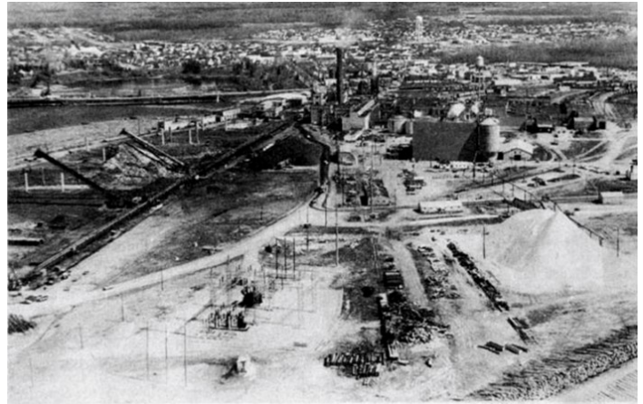
Figure 4: Aerial view of the Spruce Falls Power and Paper mill. Date unknown.

In 1926, the Spruce Falls Power and Paper Company was incorporated under joint ownership of Kimberly-Clark and The New York Times with the newspaper holding 49% of the shares. At that time, the operation was expanded to include four newsprint machines that were producing 550 tons/day of paper in 1927. Beginning on July 13, 1928, The New York Times was printed entirely on Spruce Falls paper. By 1951, the population of Kapuskasing had reached 5,000 with 1,500 being employed as Spruce Falls workers. The mill was producing 750 tons of newsprint daily. Half of the newsprint was consumed by The Times while the rest was sold to other consumers. The company's cutting rights expanded to 6,360 square miles and by the 1970s, as many as 12,500 people lived in the community.