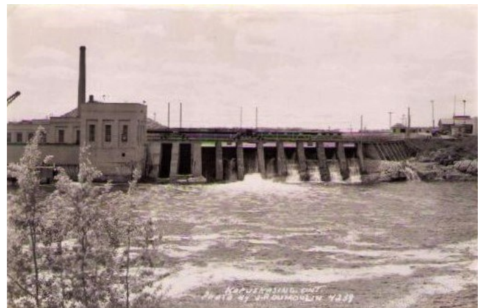
Figure 2: Power dam at Spruce Falls, Kapuskasing River, Kapuskasing, date unknown.