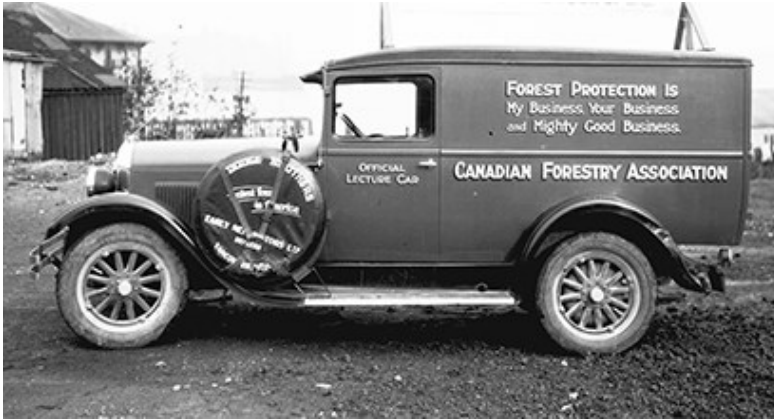
CFA Conservation Officer vehicle