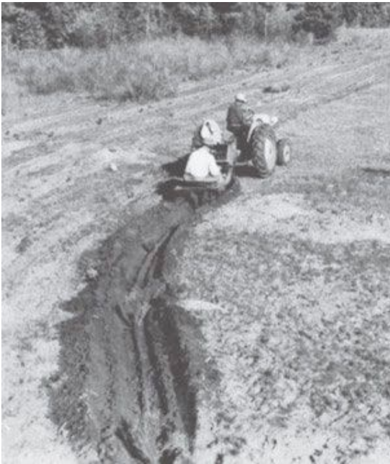
One of the earliest tree-planting machines used in Ontario is shown in operation on the lands of the Moira River Conservation Authority in the 1950s.

cottonwood and pine. The forest is also home to significant lesser plants including flowering dogwood and sassafras.