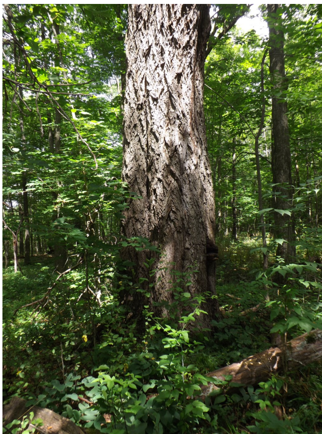
Butternut tree at the Main Tract of the Dufferin County Forest.