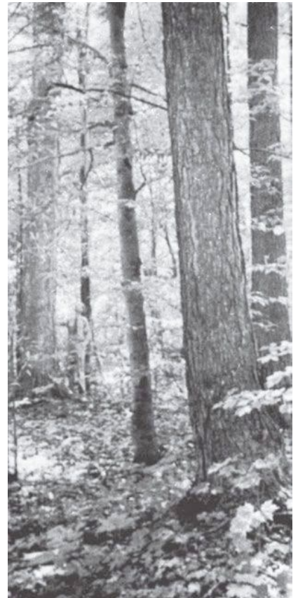
A handsome stand of sugar maple and beech on the Humber watershed.