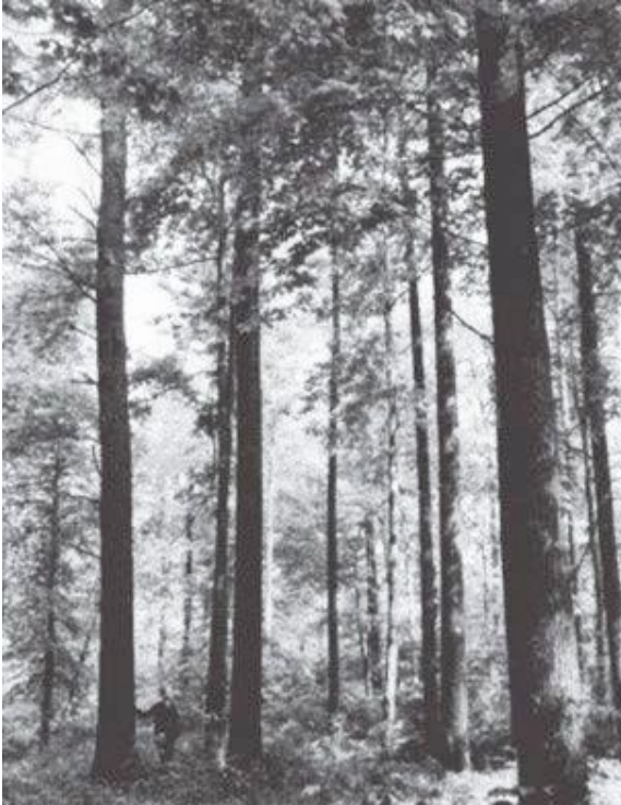
White's bush on Catfish Creek as it looked in 1950. This is one of the finest stands of climax forest in Ontario; some of the pines reach more than 125 feet in height and were mature trees when European explorers first came to the province.