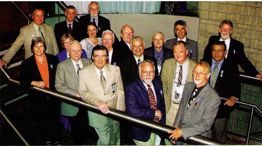
COMMEMORATIVE MEDAL FOR THE GOLDEN JUBILEE OF HER MAJESTY QUEEN ELIZABETH II

In the years following the first conference in 1906, the CFA was engaged in joint conferences with several organizations: the Society of American Foresters in 1952, a Resources Conference in 1954, a National Forestry Conference in 1956, and the British Commonwealth Conference in 1967. In more recent times, the 1986 National Forestry Congress in Ottawa was jointly organized with Canadian Pulp and Paper Association. The year 2000 marked the centenary of the CFA. With the Ontario Ministry of Natural Resources, a joint National Forestry Conference was convened in Thunder Bay. This event coincided with the designation of Ontario's northwest as Forest Capital of Canada that year.