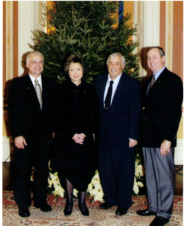
CFA delegation with the 26th Governor General of Canada Adrienne Clarkson at Rideau Hall in Ottawa, circa 2001.