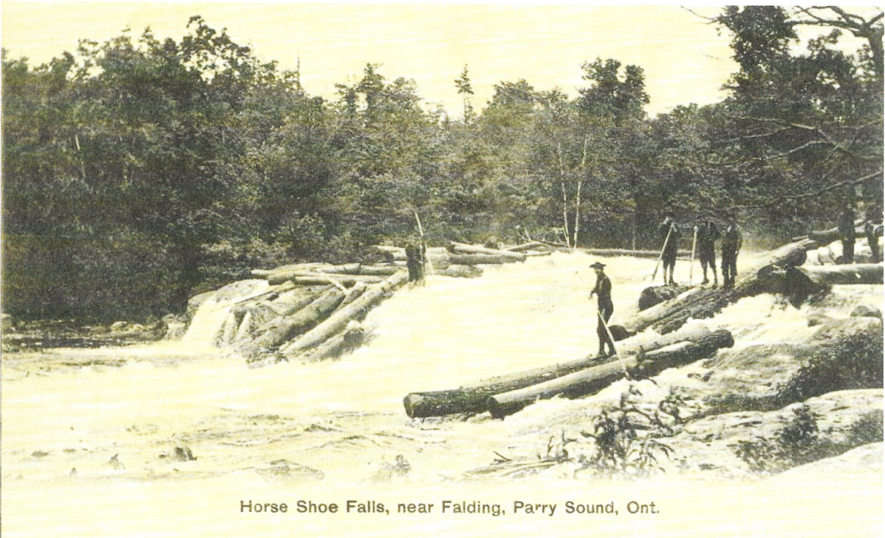
Horse Shoe Falls, near Falding, Parry Sound, Ont.

Besides, loggers reasoned, the lower leggings would soon be ragged, so they might as well cut them short. For warmth and protection, loggers would instead wear long socks that rose above the knee.