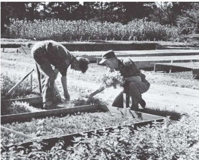
Tree-planting programs initiated by the conservation authorities have been so successful that several authorities have established their own nurseries to provide reliable, inexpensive stock.

The Metropolitan Toronto and Region Conservation Authority established its own nursery in 1957 to assist in supporting wildlife and to beautify lands ravaged by the loss of elm trees. Land owners with ten acres could obtain trees five feet in height and have them planted for a nominal fee. Up to 1970 over 37,000 trees and more than 17,000 shrubs had been planted under this program initiative.