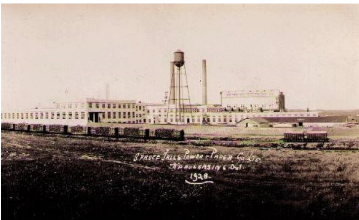
Figure 1: Spruce Falls Power and Paper mill, Kapuskasing, 1928.