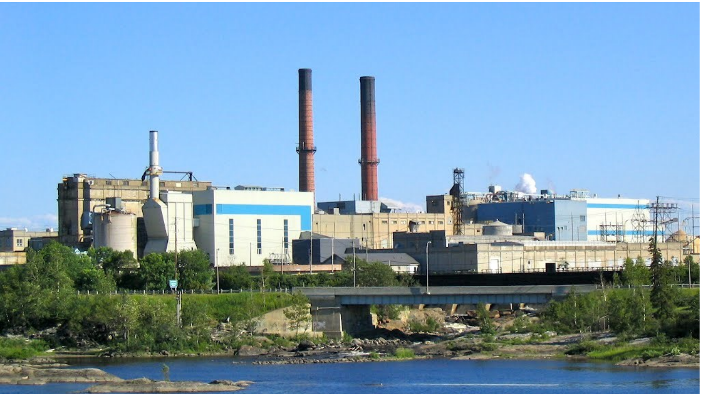
Tembec paper mill, Kapuskasing, July 16, 2006.

In July 1976, an area of injury to vegetation in the Town Park between McPherson Avenue and the Kapuskasing River was discovered. The area of injury was mapped. Most injury symptoms were apparent as intercostal necrosis (dead tissue between veins of leaves) typical of acute SO 2 fumigation